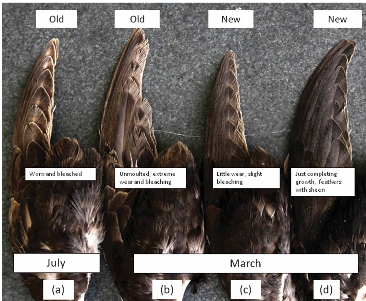
Figure 2. Wings of adult Atlantic Puffins from south-east Scotland. (a) July with old primaries, (b) March with very old primaries not replaced since the previous summer, (c) March with new primaries with some bleaching, perhaps replaced early in the nonbreeding season and (d) March with new primaries that have just completed their growth.

For Puffins involved in the March 2013 wreck a more detailed examination of the primaries was carried out to establish if a bird had moulted during the current winter and, hopefully, to estimate when its flightless period had occurred. One wing from each of 222 birds that were not in moult was air dried and the primaries compared under standard light conditions to the primaries of Puffins found freshly dead at the end of the breeding season