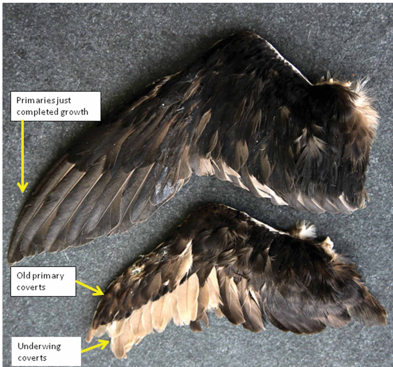
Figure 1. Wings of two adult Atlantic Puffins found dead in late March 2013. In the upper the primaries have just finished growing, in the lower the primaries have been recently moulted revealing old faded underwing coverts.

Studies during the breeding season indicate that Atlantic Puffins do not moult wing feathers at this time; flightless birds would be incapable of rearing a chick. However, identifying when moult occurs during