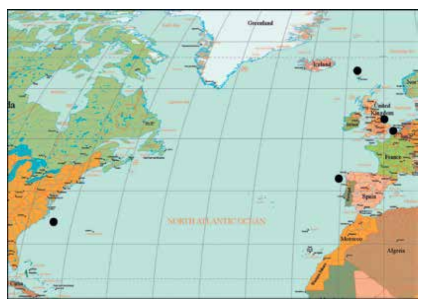
Fig. 4 Distribution of Choneziphius in the Atlantic Ocean. Verspreiding van Choneziphius in de Atlantische Oceaan.

A (see figure 1) it has a width of 74 mm which gradually increases to 126 mm (shortly after the base of the rostrum at position B). First and foremost the suture of the fused premaxillae (forming and covering a mesorostral channel) can be clearly noted from the apex to the base of the rostrum. This condition unites the subfamily Ziphiinae (to which Choneziphius belongs) within the family Ziphiiidae. In the middle of, and just posterior to, the base of the rostrum evolves the - for the genus Choneziphius - typical prominent ridge of the fused premaxillae, which separates both premaxillary sac fossae. The for Choneziphius characteristic maxillary excrescences near the base of the rostrum are just barely visible and severely eroded. Laterally the rostrum shows over most of its length the suture of the vestigial alveolar groove. Just below the base of the rostrum the suture of the palatine-maxilla is clearly visible.