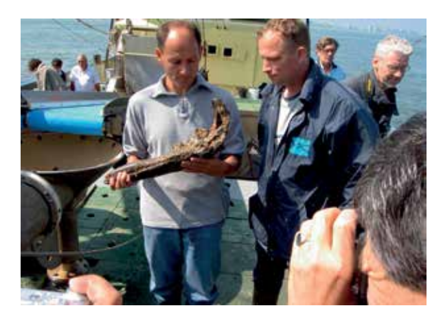
Fig. 2 A rostrum of Choneziphius caught on a scientific expedition on the Scheldt river (The Netherlands).

De ZZ 10 vist een rostrum van Choneziphius uit de Westerschelde tijdens de jaarlijkse expeditie van het Zeeuws Genootschap.